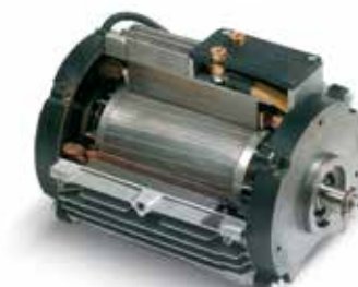
3-phase AC motor, completely enclosed, less parts to wear