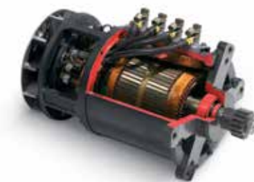
Shunt-wound or series-wound motor with carbon brushes and commutator