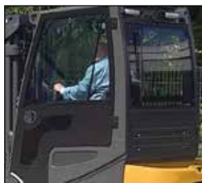
Raised operator cab (for special applications)

*Ask your local dealer for a complete list of options.