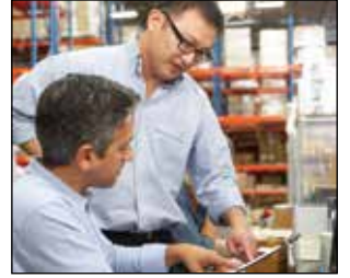
Custom financing packages