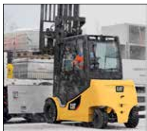
Cold storage / Tropics modification