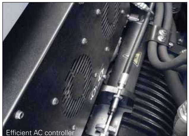
Efficient AC controller