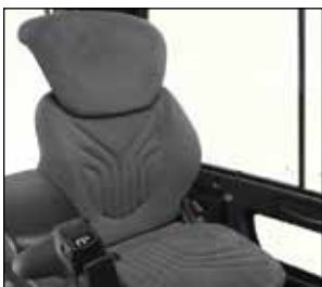
15° swivel seat

Better distributes floor loading weight on unpaved surfaces when carrying a load.