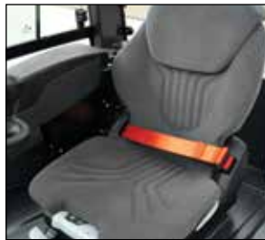
Advanced ergo seat