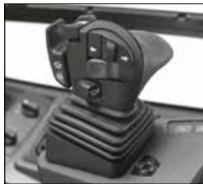
Joystick unitized control