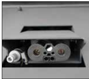
Rear charging port