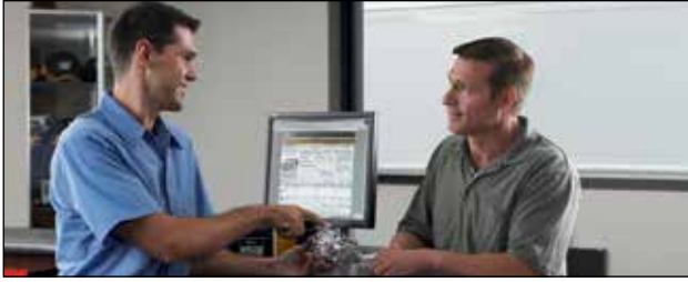
Local service and support