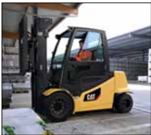
Comfort (closed) cabin