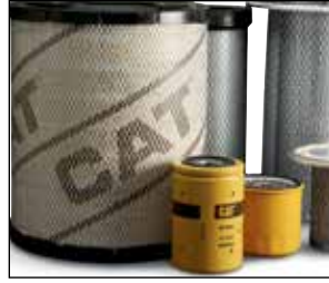
Genuine OEM parts