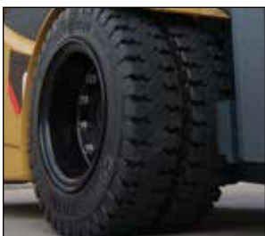
Dual solid pneumatic tires

Limits the top travel speed based on workplace preferences.