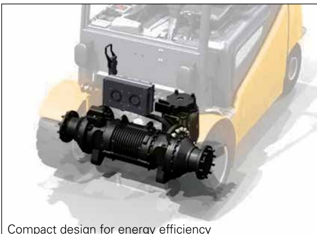
Compact design for energy efficiency