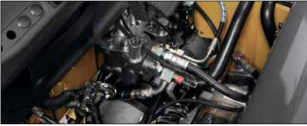
Factory warranty for added protection